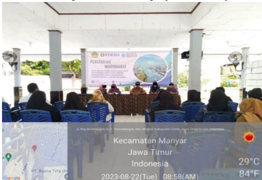
Figure 2. Documentation of Preliminary Meeting with Stakeholder of Yosowilangun Village, Gresik (Picutre were blurred due to privacy concern)

The study undertaken adopts the format of a community service initiative, firmly rooted in the foundational principles of the Tri Dharma Perguruan Tinggi—the three core pillars of higher education, encompassing education, research, and community service. The results achieved through this program can be detailed as follows: Figure 2 provides a visual representation of the preliminary meeting conducted with key stakeholders from Yosowilangun Village. This meeting brought together several prominent figures, including the Village Head, members of the Village Administration, and the Head of the Family Welfare Movement (PKK). Their active participation in this discussion serves as a testament to the village's sincere commitment and enthusiasm for the proposed study. Such engagement underscores the importance of involving local leaders and representatives in community-based initiatives to ensure alignment with the village's priorities and objectives.