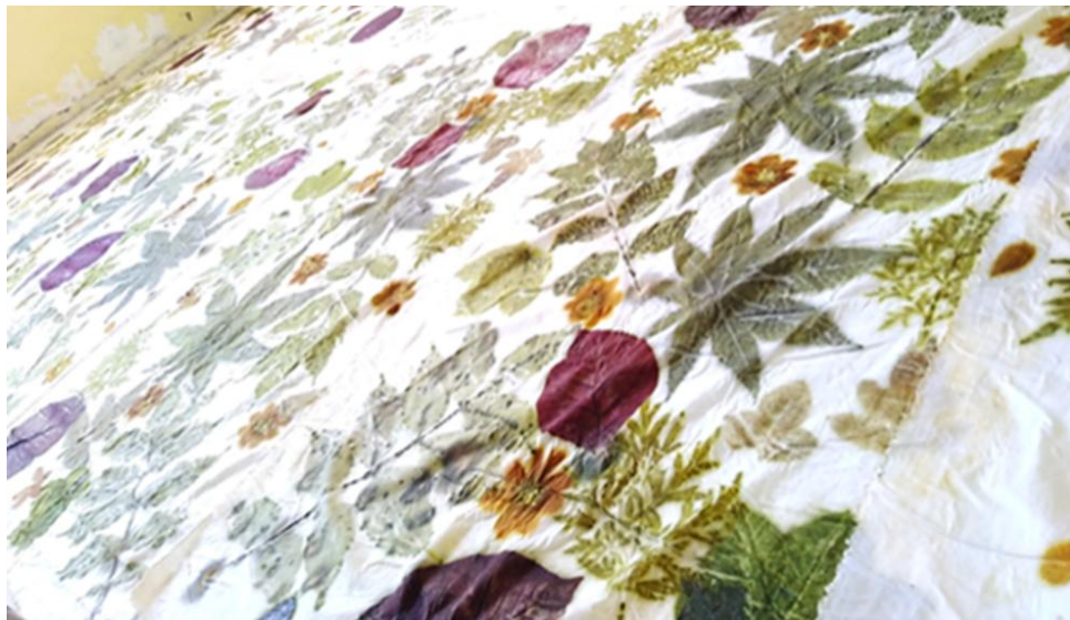
Figure 4. Showcase of Eco-print Product

Once the Eco-Print had been folded into smaller sections, it underwent a boiling procedure lasting up to 30 minutes. This boiling process was implemented to ensure that the coloration from the leaves adhered to the fabric's surface even after the leaves had been removed. Following the conclusion of the heating phase, the Eco-Print was carefully removed from the boiler. Subsequently, the Eco-Print was unwrapped to unveil its contents and then displayed within the premises of the Family Welfare Movement's Office as an exhibition showcasing the fruits of the participants' labor from the training. Selected examples of the Eco-Print items crafted by the participants are depicted in picture 4.