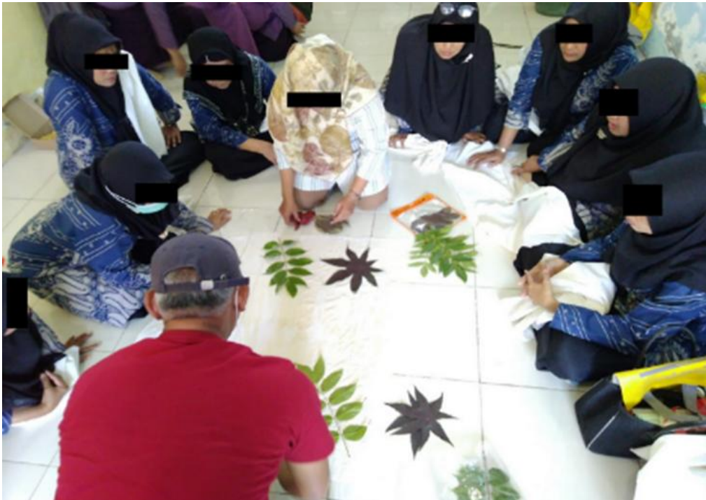
Figure 3. Documentation of Introducing Waste Materials

The training conducted will span a full day. It will commence with an introduction to the waste materials that can be employed in the creation of Eco-Print, and a presentation highlighting the economic value of the final Eco-Print products.