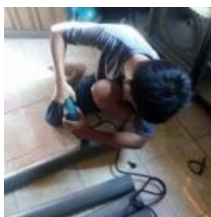
Figure 4. Assembling hydroponic installations is carried out from 12 - 19 August 2018