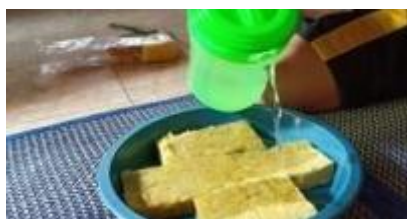
Figure 3. Seeding is carried out from August 7-21, 2018