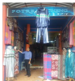
Figure 2. Conditions for batik sales place