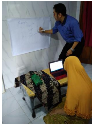
Figure 4. Explanation and Training on Marketing Mix Concepts and Online Advertising