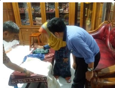
Figure 3. Interview with Craftsmen