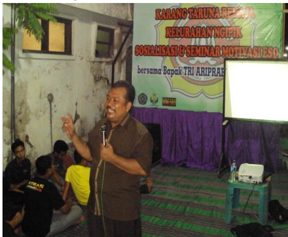
Figure 2: Strengthening Soft Entrepreneurship Skills