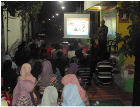
Figure 1: Entrepreneurship Elaboration