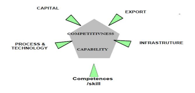
Figure 1 Five dimensions of competitiveness (Worasinchai & Bechina, 2010, pp. 171-180)

There is a growing recognition that MNCs could potentially impact several dimensions that are crucial for developing countries aiming at improving their competitiveness. These dimensions include capital, competences/skills, exports, technology/processes and infrastructure, as shown in Figure 1.