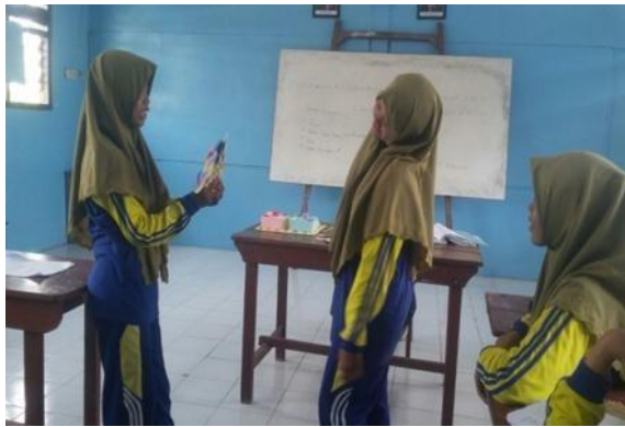
Figure 2. observations and tests

Below is the value of English for eighth-grade students of MTs. Muhammadiyah 10 Wukir about Expression of Like and Dislike with the topic of favorite foods and beverages, before using the Lolly-pop Card media: