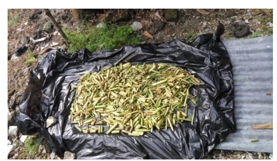
Figure 3Water Hyacinth After Dried