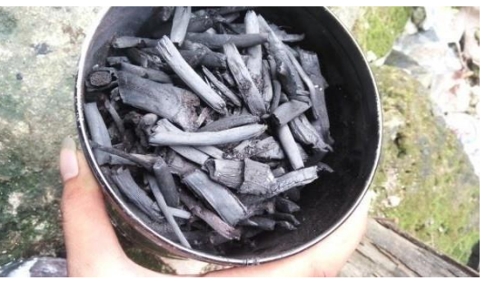
Figure 5 Results of the Ruling