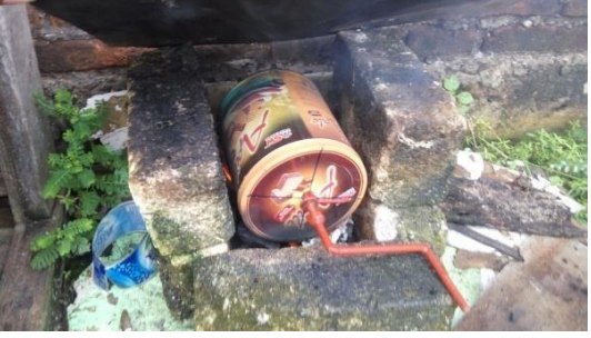
Figure 4 The Process of Harvesting