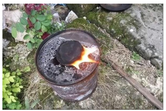
Figure 7 Briquette Experiment Process