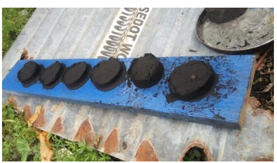
Figure 6 Results