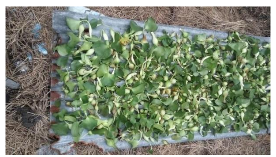
Figure 2 Water Hyacinth Drying Process