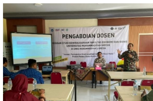
Figure 3. Team of PKM Lecturers Training Presentation

If our recommendations from the PKM team of lecturers are implemented, it will at least add to the insight of teachers in the field of entrepreneurship, produce entrepreneurship learning models to be taught to students, while at the same time confirming that entrepreneurship learning is not enough with theory but also the need for practical training and getting insight from outside to be able to inspiration from the world of industry by conducting industry safaris to the world of entrepreneurial industry both in Gresik Regency and in other inspiring areas that can encourage students to have entrepreneurial characteristics and have the mindset and insight of Islamic entrepreneurs, and of course will bring and accelerate the school's vision and mission that has been proclaimed, namely, Vision: To become a school that is strong, has character, and has an entrepreneurial spirit. Mission: (1) The developing a modern learning system with Islamic character; (2) Developing a learning system based on the industrial world and the business world; (3) As well as developing a learning system by prioritizing entrepreneurial values.