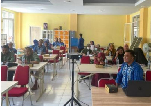
Figure 2. Enthusiasm of the Teachers before the Implementation of Entrepreneurship Education Training

Vocational School, and Mamba'ul Ihsan Ujungpangkah Gresik Vocational School. The MoU signing activities focused on education, research, community service (PKM) and library management as well as awarding scholarships.