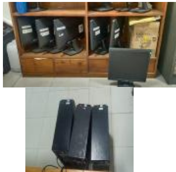
Figure 5. Data collection of unused computers

The initial step taken by the Mechanical Engineering Department service team was to collect data on how many PC computer units in the form of CPUs and monitors that can still be used. After collecting data on several PC computers that can still be used, 10 PC computers (including CPU, monitor, and keyboard). Some examples of findings from PC computer data collection can be seen in Figure 5 below.