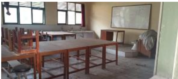
Figure 1. The condition of science study room/laboratory

The inadequate condition of the study room infrastructure is one of the reasons for the lack of motivation of Muhammadiyah residents to send their children to that school, few students attend Muhammadiyah Tanjung Junior High School. Each level only consists of 1 or 2 classrooms with an unequal number of students. Apart from that, due to the condition of the parents who generally only work as laborers and farmers, Muhammadiyah Tanjung Junior High School is it cannot decide the high cost of education varies. Under these conditions, schools are greatly assisted by the existence of reliable school operational assistance funds Bantuan Operasi Sekolah (BOS) for the implementation of education. Therefore, schools are unable to develop additional infrastructure such as materials, equipment, and media for student learning knowledge. The science teaching and learning rooms available at Tanjung Muhammadiyah Junior High School are not equipped with equipment and computer media to support the student learning process, as shown in.