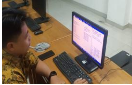
Figure 6. Unused PC computer installation process

The next stage of conditioning the PC computer unit is installing or setting up the system in the form of software. Each PC computer unit is reinstalled to ensure the program in that unit can run smoothly. The installation process is carried out from the most basic stages through the bios settings so that the time settings and system settings comply with applicable international standards. The next arrangement is to install basic office programs so that users (students) can directly operate office programs in general with ease. The installation process of the PC computer unit can be seen in Figure 6 below.