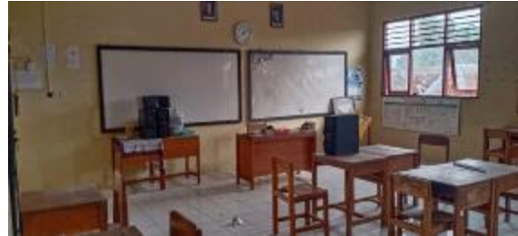
Figure 2. The condition of the computer study room without computer tools and media

laboratory room as a permanent place to study computer technology. Not only the place, the school also does not have adequate computer equipment. Muhammadiyah Tanjung Junior High School has a computer and multimedia laboratory room, but is not equipped with a computer unit for student teaching and learning, as shown in Figure 2.