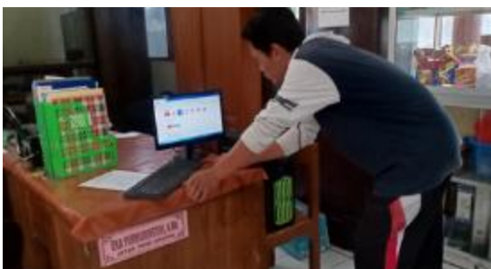
Figure 9. Checking the computer program used in learning and evaluation by teacher staff and computer technicians at Muhammadiyah Tanjung Junior High School