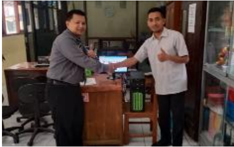
Figure 8. Documentation of delivery of PC computer units to the Principal of Muhammadiyah Tanjung Junior High School

After the computer unit was installed according to standard conditions and programs, the computer was handed over to the Tanjung Muhammadiyah Middle School, which was symbolically accepted by the school principal, as shown in Figure 8 below.