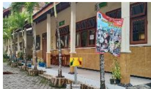
Figure 3. Condition of classrooms at SMP Muhammadiyah Tanjung

The development of information and communication technology continues to increase along with increasing human needs, without exception in the field of education (Tekege, 2017). Limited facilities and infrastructure as well as inadequate human resources for laboratory managers mean that laboratory functions cannot be maximally empowered to support the teaching and learning process for students. When linked to the teaching and learning process in schools, networked computer engineering laboratories can make a very valuable contribution in efforts to improve students skills and improve the quality of competency learning in the field of computer technology (Hariyanto & Bambang Sumardjoko, 2016). Apart from having limitations in managing classrooms, Muhammadiyah Junior High School also only has permanent class sections, which only have a few 8 study rooms. During the Covid-19 pandemic the study room was not maintained, as shown in Figure 3.