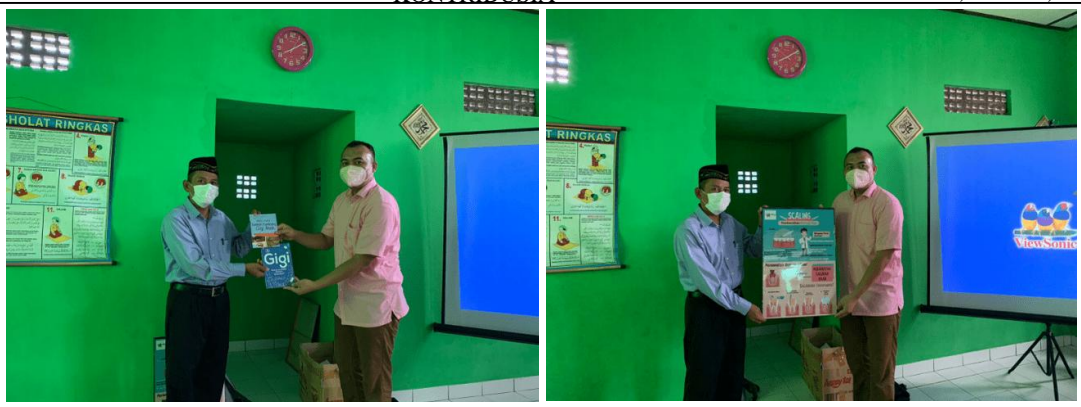
Figure 2. Received grants (a) dental and oral health books, and (b) educational posters to the Head of Wuluhadeg Elementary School, Sanden, Bantul