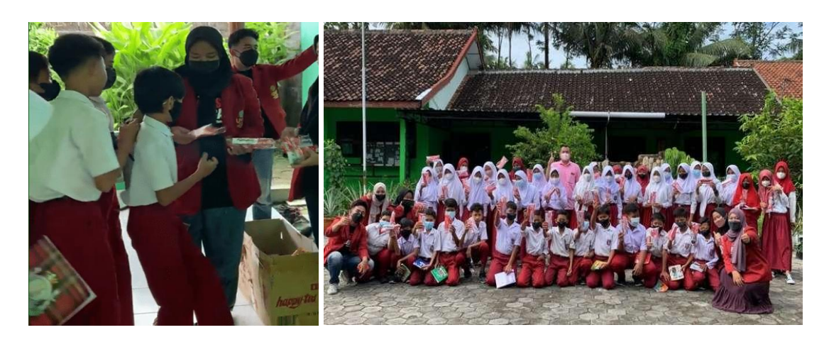
Figure 3. (a) Distribution of free toothbrushes and toothpaste to extension participants, (b) Group photo after the completion of counseling to prevent dental and oral health problems