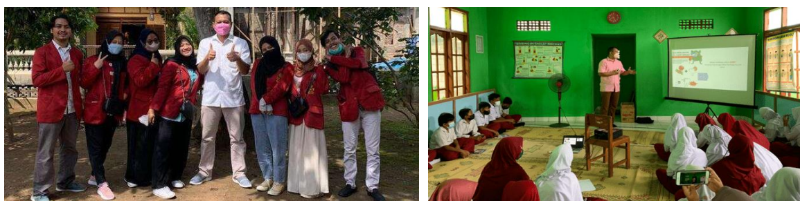
Figure 1. (a) Photo after discussion and observation of location of dental and oral health counseling with UMY KKN student's odd semester 2021/2022 (b) Dental and oral health education