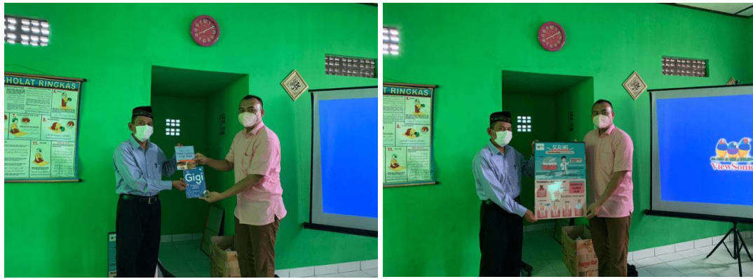
Figure 2. Received grants (a) dental and oral health books, and (b) educational posters to the Head of Wuluhadeg Elementary School, Sanden, Bantul