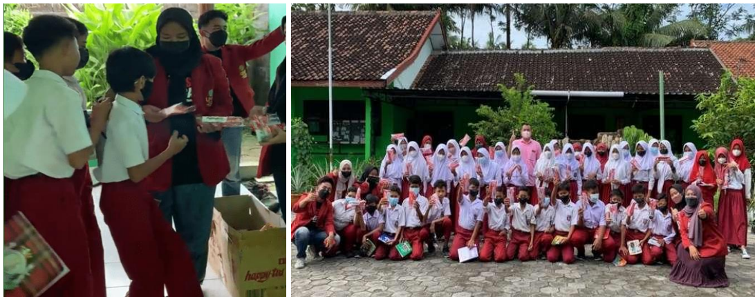
Figure 3. (a) Distribution of free toothbrushes and toothpaste to extension participants, (b) Group photo after the completion of counseling to prevent dental and oral health problems