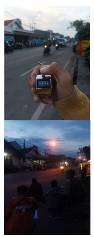
Figure 1. Surveying