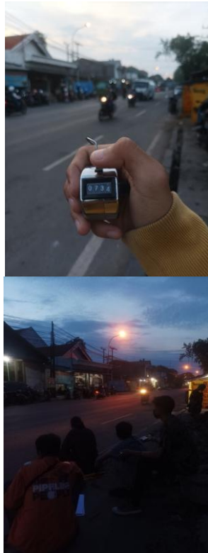
Figure 1. Surveying

was conducted on Monday, as shown in Figure 1, and based on the graph, the peak hours with the most significant total volume in both directions occurred on Monday afternoon. Obtained the traffic volume in both directions at peak hours 11.00 AM – 12.00 AM of 1,170 smp/hour and 1,156 smp/hour.