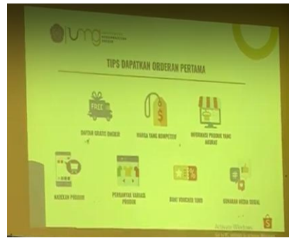
Figure 3. Shopee E-Commerce Training Materials