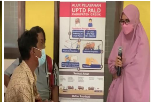
Figure 4. Discussion and Q&A with MSME owners

The second stage of implementation, on February 13, 2022, training activities for processed Bandeng innovations were carried out. The innovation is carried out by playing video recordings of the process of making Bandeng meat rolls that are already good and the desired results are obtained. The video that was played during the training activities, accompanied by the provision of samples of processed Bandeng made in rolls, was distributed to MSME actors in Betoयोगuci Village who participated in the training. When the video was played and the Bandeng meat roll was given, the team also asked for feedback on the flavors and innovations made and opened a question and answer discussion session.