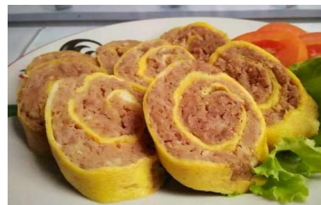
Gambar 1. Rolade Bandeng Result