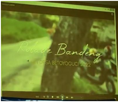
Figure 2. Video recording rolade bandeng