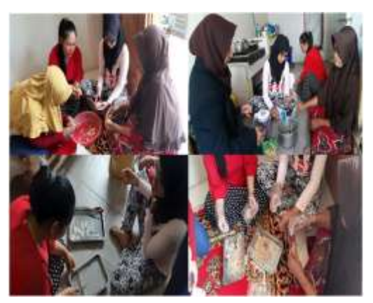
Figure 1. Community Involvement in the Process of Making Dried Siwalan Jelly

understanding and skills of partners related to the technique of making Jelly Siwalan.