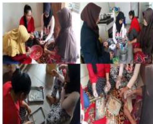
Figure 1. Community Involvement in the Process of Making Dried Siwalan Jelly

understanding and skills of partners related to the technique of making Jelly Siwalan.