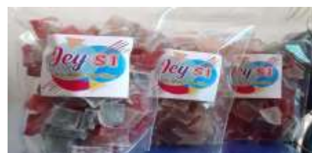
Figure 2. Packaged Dried Siwalan Jelly Products

simple packaging and have attractive colour variations. They are sold at affordable prices to be enjoyed by all people, especially children and residents from outside Tuban City. This dried Siwalan jelly is made into unique food products and by using food ingredients that are safe for consumption and do not use preservatives. With the durability of 1 month at room temperature and approximately two months in the refrigerator.