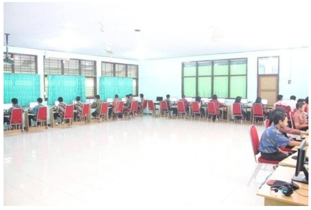
Figure 1. RPL Laboratory for UKK

Values (NA), and set forth in the form of the Minutes of Examination and Value List of Vocational Practice Test (UPK) Software Engineering Department (RPL) of each SMK involved. A list of Vocational Practices Values (Vocational Training Values) from SMK Negeri 6 Jember and each SMK Penggabung in detail can be seen in the Appendix, and will be further analyzed as evaluation material of UKK activities in 2017.