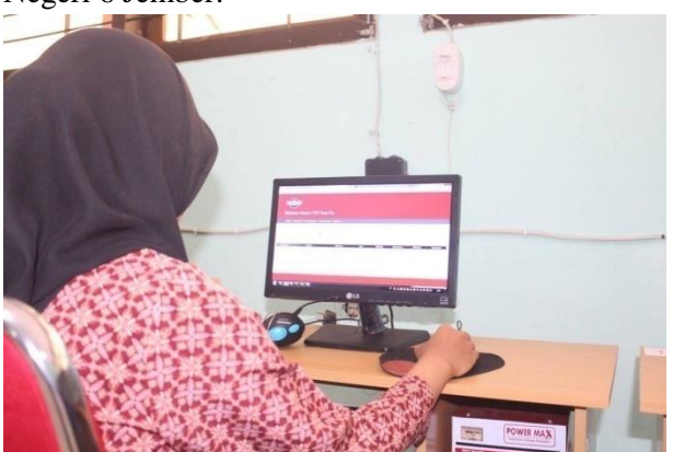
Figure 2. Learners' Practice Activity

Picture 2 below shows one of the learners who are working on the problem package 3 car rental application design in Computer Laboratory Software Engineering Department (RPL) SMK Negeri 6 Jember.