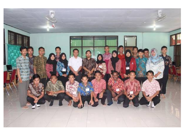
Figure 3. The Post-Assistance Facility of UKK

(DUDI), Companion Teachers from SMK Negeri 6 Jember and SMK Penggabung to respond or evaluate the values that have been produced and take measurable remedial actions for students who have not reached the final value of Minimum Skills Competence (KKM).