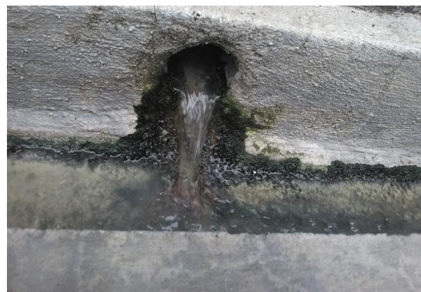
Figure 9. IKM eco-friendly waste