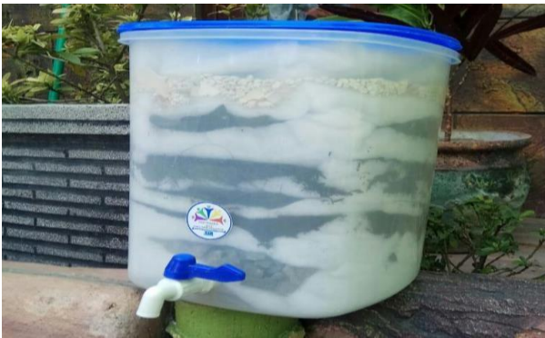
Figure 7. Waste processing