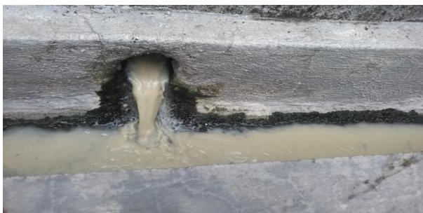
Figure 2. Tempe liquid waste thrown into a ditch