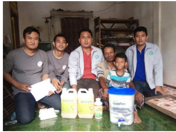
Figure 5. Coaching waste treatment

Alternative treatment of Tempe liquid waste with the right tools and make Tempe liquid waste into liquid fertilizer is a solution to prevention of environmental pollution. Liquid waste obtained from tempe industry of Dukunanyar village RT.01 / RW.01. Then do the processing using appropriate tool and making productive liquid fertilizer. Furthermore, the activities of socialization and coaching in Tempe industry. Monitoring activities were conducted with assistance to Tempe industry during the KKN period.