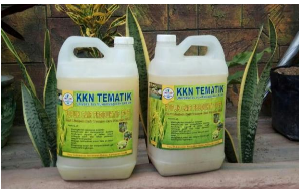
Figure 8. Liquid Fertilizer Product (PCP)

Utilization of liquid waste Tempe into Liquid Productive Fertilizer (PCP) is the right way to create a byproduct of Tempe industry. To provide value added toward wastewater that was originally just as waste and dumped into the river. The result of this program is Tempe industry get help how to use waste into Liquid Productive Fertilizer (PCP), so that can reduce the environmental pollution caused by liquid waste Tempe. IKM Tempe get sample product Liquid Productive Fertilizer (PCP) from waste of Tempe