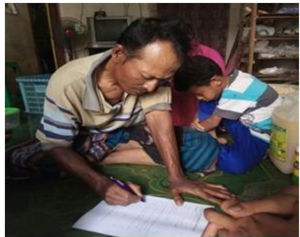
Figure 6. Assistance activities