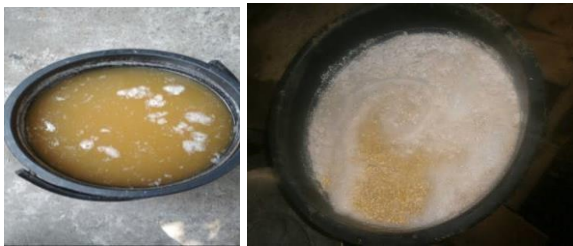
Figure 1. Tempe liquid waste in bucket