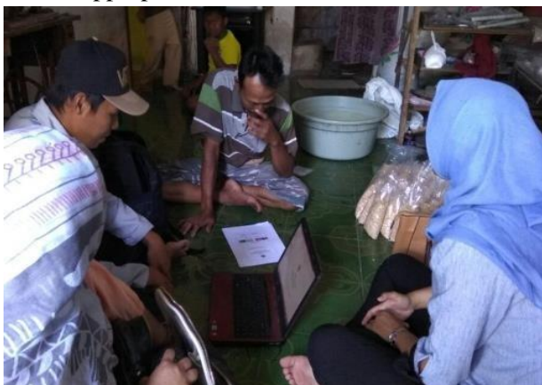
Figure 3. Direct socialization at home industry of IKM Tempe with resource persons

Visits to Small and Medium Industry (IKM) Tempe with resource persons from the Office of Koperindag Miss. Olin Lintang to provide socialization about the dangers of tempe liquid waste when disposed of directly into the river and appropriate effluent treatment.