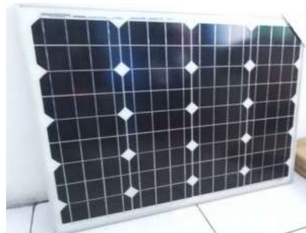
Figure 7. PV Monocrystalline

Crystallite (PC) type. The obstacle referred to in capturing solar energy falling onto the PV surface will be more acceptable if using an MC system.