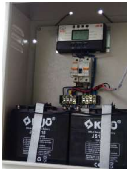
Figure 2. Inside Panel Box

Some of the devices installed are the panel box control system for the PLTS disinfectant pump, as shown in the picture