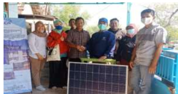
Figure 8. Handover the PV System to Kaliao Village

In this picture when the PV system was given to Kaliao Village.