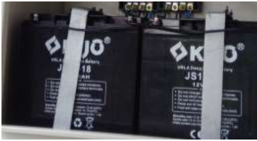
Figure 5. Battery

After entering the SCC, the output is divided into two directions: entering the ACCU and the other towards Load. To carry out remote monitoring, the Internet of Things is used, namely Android. Monitoring is carried out on the PV output voltage and the SCC output voltage towards the load. SCC can be seen in Figure 5.6. This monitoring monitors the voltage and current. This monitor is done by sending a signal to the Android, and checking can be done at any time on time. In this system, the SCC used is 10 A because the current calculation through it is not more than 10A.