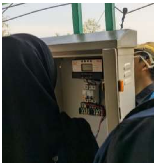
Figure 3. Panel Box Outside

In Figure 2. You can see the panel box inside; there are several MCBs, terminals, and terminals for system operation. Meanwhile, on the outside of the panel box, as shown in Figure 3.