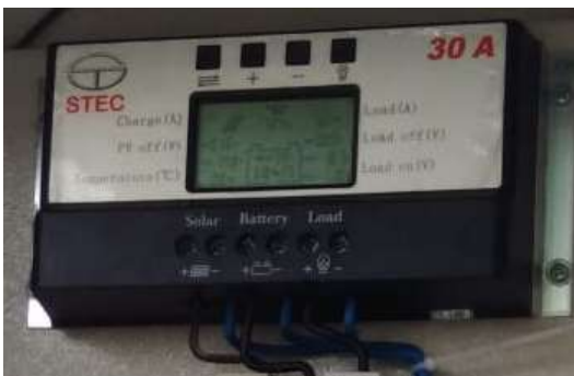
Figure 6. Solar Charge Controller

After entering the SCC, the output is divided into two directions: entering the ACCU and the other towards Load. To carry out remote monitoring, the Internet of Things is used, namely Android. Monitoring is carried out on the PV output voltage and the SCC output voltage towards the load. SCC can be seen in Figure 5.6. This monitoring monitors the voltage and current. This monitor is done by sending a signal to the Android, and checking can be done at any time on time. In this system, the SCC used is 10 A because the current calculation through it is not more than 10A.