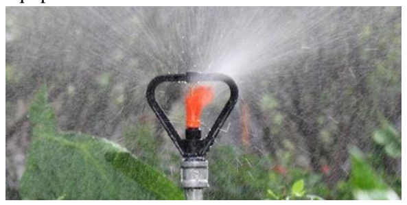
Figure 3 Sprinkler Watering Process

The results of the work program held by Industrial Engineering program group 6 by implementing the ergonomic garden watering equipment.