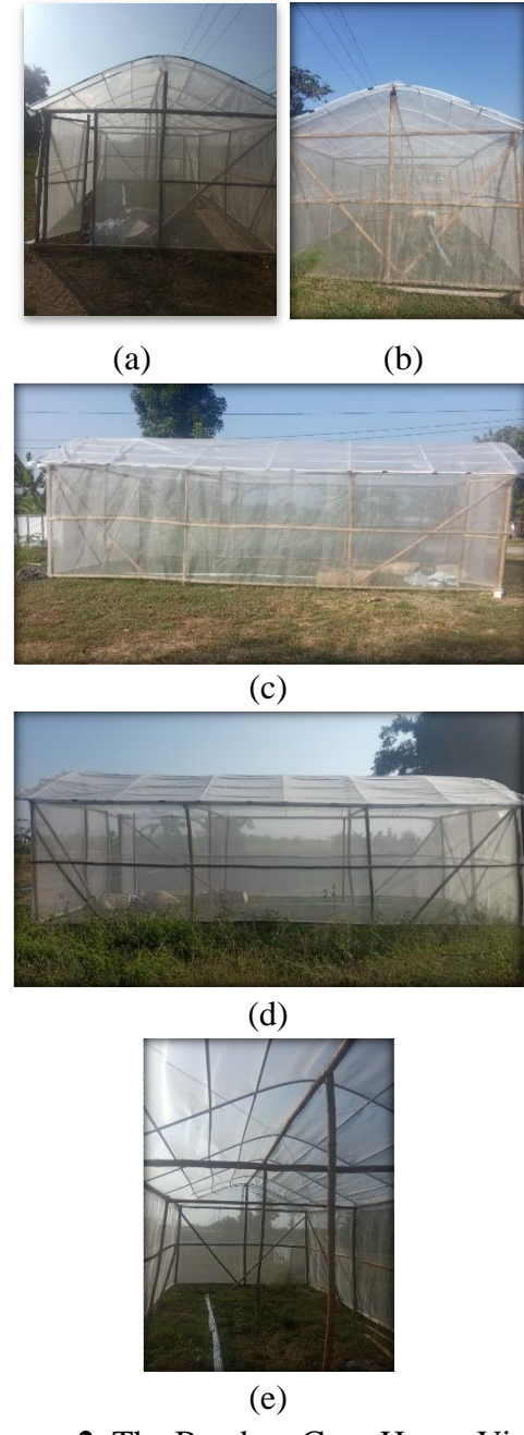
Figure 2. The Bamboo Crop House Views (a) front (b) back (c) left (d) right (e) back