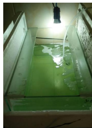
Figure 2. Spirulina culture in medium-scale

The salinity of Spirulina was maintained at 30 ppt in small-scale culture for seven days. In this cultural type, the cell density of Spirulina was significantly increased due to its favorable condition (Mahrouqi et al., 2015). The density of Spirulina was increased from 50 \times 10^3 cells \text{ml}^{-1} to 500 \times 10^3 cells \text{ml}^{-1} in seven days, as seen in figure 3a. After that, the salinity was gradually diminished every three days in medium-scale culture. Nevertheless, Spirulina 's density was slowly decreased from 270 \times 10^3 cells \text{ml}^{-1} to 160 \times 10^3 cells \text{ml}^{-1} in 25 ppt; 145 \times 10^3 cells \text{ml}^{-1} in 23 ppt; 81 \times 10^3 cells \text{ml}^{-1} in 20 ppt; and 41.8 \times 10^3 cells \text{ml}^{-1} in 15 ppt (figure 3b). The cell density of Spirulina in 15 ppt was quite unstable. Therefore mass-production was optimized in 20 ppt. In this study, although each treatment had different salinity, nevertheless the water parameter was the least different (figure 3c). For this reason, we conclude that the degradation of Spirulina 's cell density was majorly due to its reduced salinity.