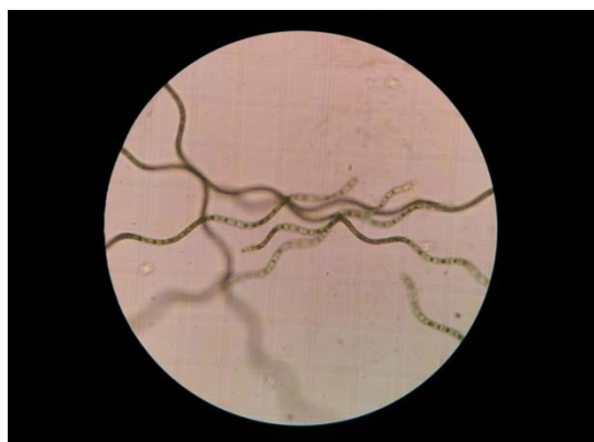
Figure 1. Spirulina sp. structure under microscope

autotroph and converted sunlight energy to chemical energy in carbohydrates form (Soni et al., 2017). This research was investigated Spirulina with blue-green helical twisting filamentous structure, as seen in Figure 1, suggesting microalgae characteristics. The Spirulina showed spherical shapes on the surface. Our results were similar to other Spirulina powder products for animal feed or functional food (Singh, 2011).