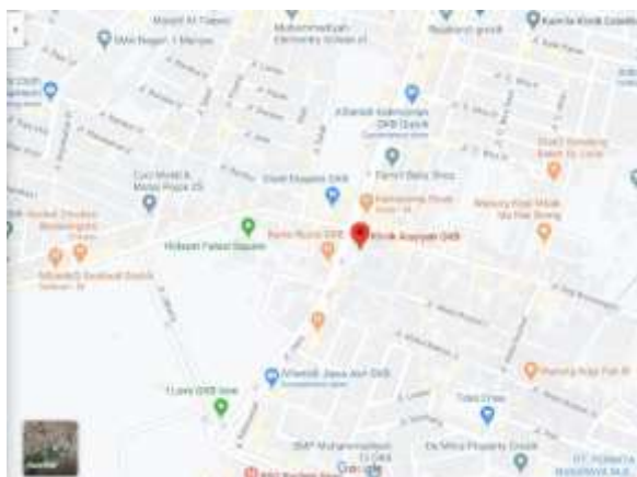
Figure 3. Map of Aisyiah Clinic

Aisyiah Clinic that located at Gresik Kota Baru is one of the clinics formed by Muhammadiyah Hospital Gresik. This clinic is long enough to establish; however, their need is still supplied by Muhammadiyah Hospital Gresik. The map of Aisyiah Clinic can be shown in figure 3. The completed address of this clinic is Java street no. 116-118, Karanggondang, Yosowilangun, Gresik District, East Java 61121.