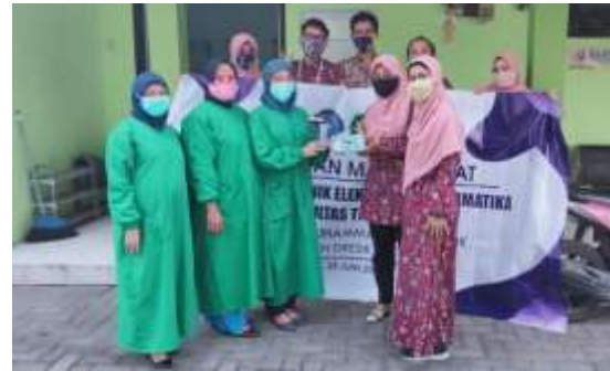
Figure 12. Electrical Engineering and Informatics donate Maskers and Automatic Spray Pump of Hand Sanitizer

The personal protective equipment which is needed by Aisyiah clinic is 5 Boxes Masker; two jerry can Hand Sanitizer and Automatic Spray Pump tool. In figure 12, it is seen the ceremonial of donating all of the stuff to help Aisyiah Clinic face Corona Viruses 19 Pandemic.