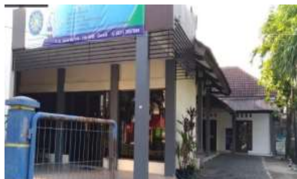
Figure 4. Aisyiah Clinic GKB

The facilities of Aisyiah clinic are general disease, dental care, and childbirth care. There are photos of the facilities clinic, as seen in Figures 4-7. They also open 24 hours daily to serve society around them.