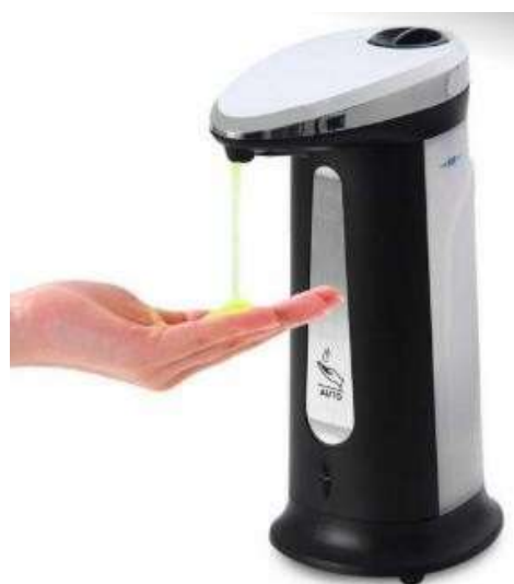
Figure 9. Automatic Spray Pump of Hand Sanitizer

The automatic spray pump of hand sanitizer as a real picture can be seen in figure 9. Besides, we provide this intuitive tool and the hand sanitizer refill; we also prepare some medical masker to fill the clinic need. This stuff is very needed by Aisyiah Clinic GKB.