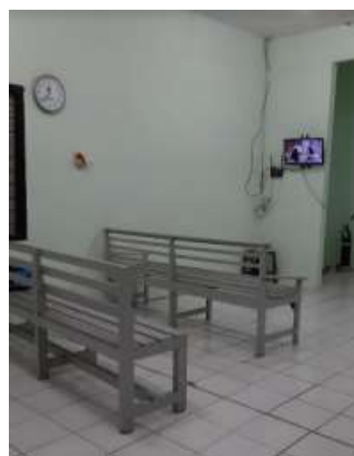
Figure 6. Waiting Room Aisyiah Clinic GKB

In the pandemic era, Aisyiah Clinic serves many patients, so that sometimes their stock of personal protective equipment often shortage, and they have to wait for them from Muhammadiyah Hospital Gresik.