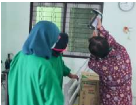
Figure 11. Explaining How to Replace Battery

The replacing battery process also has been explained to the medical staff of Aisyiah Clinic GKB, and it is shown in figure 11. They understood how the working system cause it is a simple process.