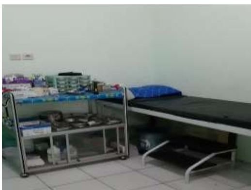
Figure 7. Dental Care Facility

By observing their need at this clinic; thus, we found that they need not only some maskers but also hand Sanitizer. Both tools are essential for handling the patient. We think that we need to make a tool used to fill the hand sanitizer, and it has to be touchless to avoid coronaviruses.