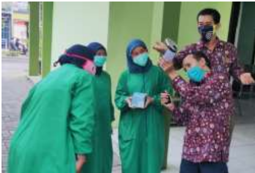
Figure 10. Our Team Explain The Work of Automatic Spray Pump of Hand Sanitizer

Before our team gives the personal protective equipment, we explain the work of an automatic spray pump of hand sanitizer to the medical staff of Aisyiah Clinic GKB. In Figure 10, it is shown our team when explaining the process of the mechanical system.