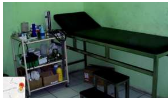
Figure 5. General Care Facility

In the pandemic era, Aisyiah Clinic serves many patients, so that sometimes their stock of personal protective equipment often shortage, and they have to wait for them from Muhammadiyah Hospital Gresik.