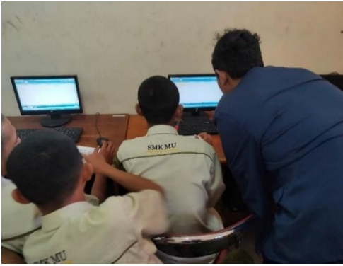
Figure 3. Connecting AVR Atmega Microcontroller