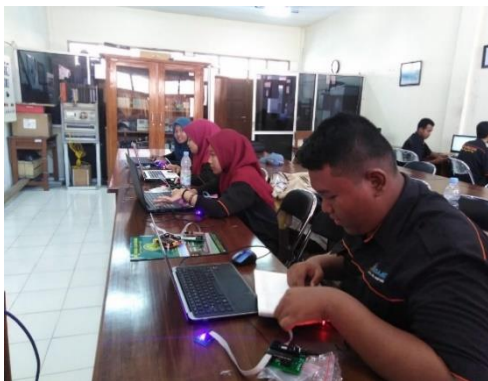
Figure 4. Programming the Seven Segment control