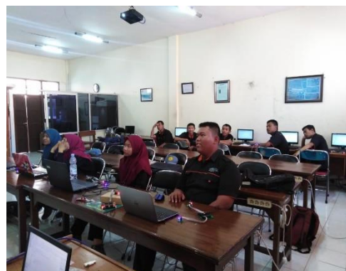
Figure 2. Lecture on architecture and features of AVR Atmega Microcontroller

The results achieved in the community partnership program is: The ability or competence of vocational students, especially SMK Manbaul Ulum Kebomas Gresik, in terms of the Atmega Microcontroller architecture and programming basics. This activity's implementation took place in the Electric Energy Conversion Laboratory, Electrical Engineering Study Program, Muhammadiyah University Gresik.