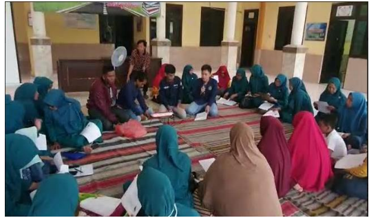
Figure 2. Discussion of participants and organizers

Explanation of shrimp nugget processing material is very important to provide knowledge, insight and guidance in its implementation, so that after the program is finished the community can independently process the catch of fishermen in the village of Kroman. This material also provides an understanding of the importance of processing fisheries products so that they are motivated to form a business group in the village of Kroman. Although there were not too many participants, the enthusiasm of the participants was worth comparing. This is evidenced by the active participation of participants in discussions and counseling on shrimp nuggets product processing.