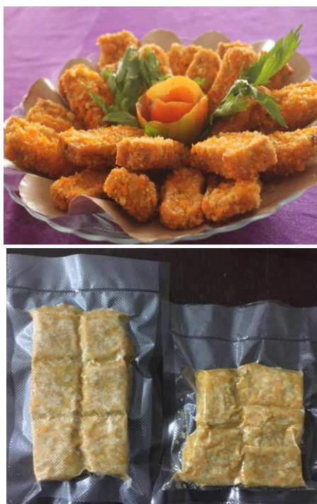
Figure 3. Milkfish processed products

will be useful as additional income for the community in the village of Kroman.