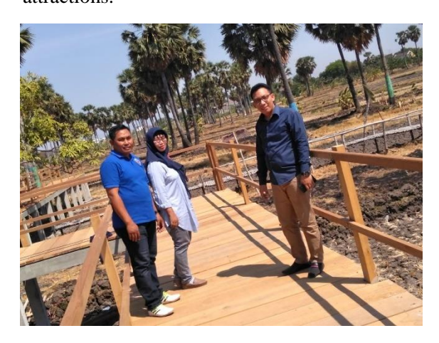
Figure 3. Site Visit & Discussion

During the visit to our location, the PKM team was shown one by one the village community business units around the village area including the handicraft business, grilled chicken, and Siwalan ice dawet drinks, as well as showing the sights of the Lotar sewu tourist attractions.