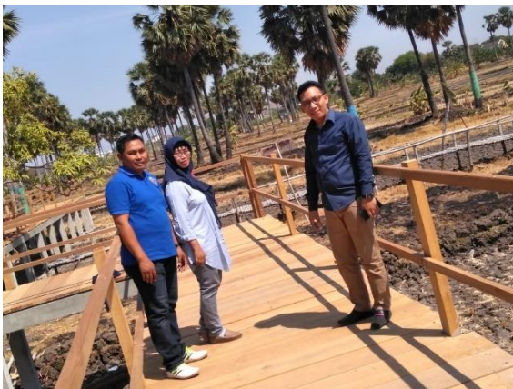
Figure 3. Site Visit & Discussion

During the visit to our location, the PKM team was shown one by one the village community business units around the village area including the handicraft business, grilled chicken, and Siwalan ice dawet drinks, as well as showing the sights of the Lotar sewu tourist attractions.