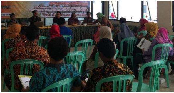
Figure 2. The Community Foster Entrepreneurial Souls

Together with partners, the servants carried out several activities including: