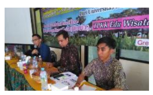
Figure 4 Strengthening Managerial Knowledge and Skills

Together with partners, the servants carried out several activities including: