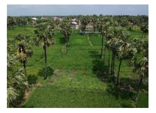
Figure 2. Potential Conditions in Hendrosari Village for Tourism

The opportunity to develop Hendrosari village, especially in the tourism sector with an area of about 10 hectares by making rides for selfie areas and playgrounds for children. In addition, the creation of a system for the implementation of the village tourism program and management improvement in its management needs to be carried out for the implementation of Lontar Sewu educational tour activities.