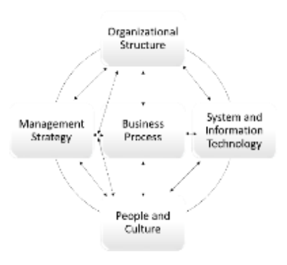
Figure 5. Overview of Science and Technology to Be Implemented in Partners