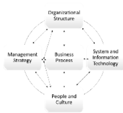
Figure 5. Overview of Science and Technology to Be Implemented in Partners