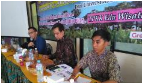
Figure 4 Strengthening Managerial Knowledge and Skills

Together with partners, the servants carried out several activities including: