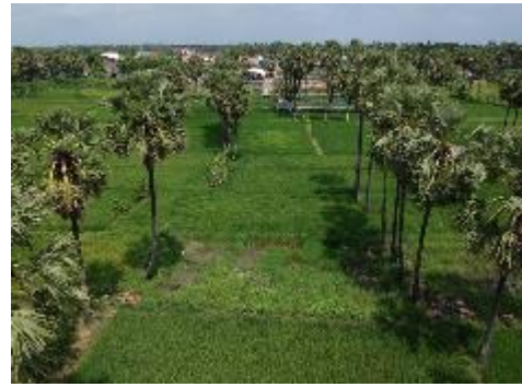
Figure 2. Potential Conditions in Hendrosari Village for Tourism

The opportunity to develop Hendrosari village, especially in the tourism sector with an area of about 10 hectares by making rides for selfie areas and playgrounds for children. In addition, the creation of a system for the implementation of the village tourism program and management improvement in its management needs to be carried out for the implementation of Lontar Sewu educational tour activities.