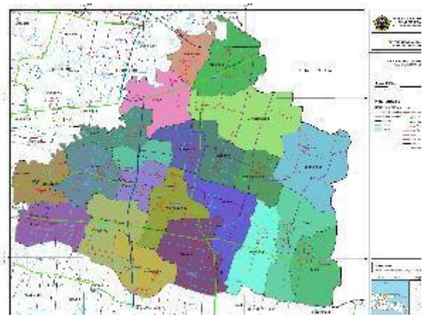
Figure 1. Location Map and Topographic Profile of Hendrosari Village