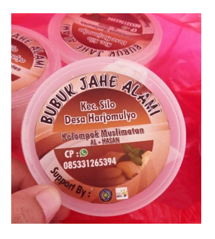
Figure 1. Instant Ginger Packaging Design

The following below is an example of the design of instant ginger packaging that resulted from several discussions with the core administrators of the Al-Hasan Muslim group.