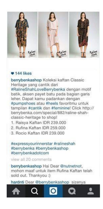
Figure 3. Example instagram account that has a lot of followers