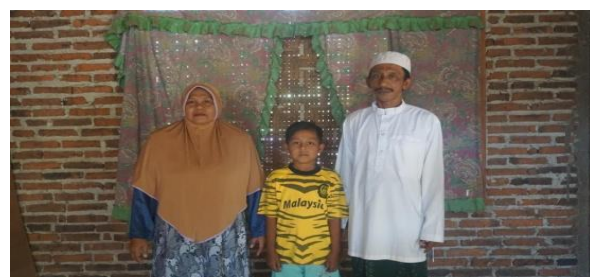
Figure 6. Family photo.