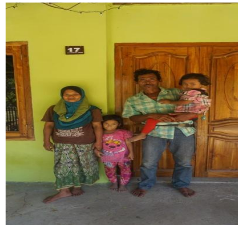
Figure 5. Family photo.