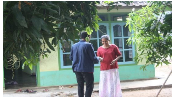
Figure 3. Submission of family photos.