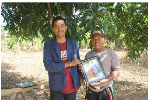
Figure 2. Submission of family photos.

Overall this program has been implemented in accordance with the theory and as much as possible. In addition, based on the results of the implementation of this program, it can be concluded that this technique photovoice can increase the empathy attitude of the Alas Timur Bawean Gresik hamlet.