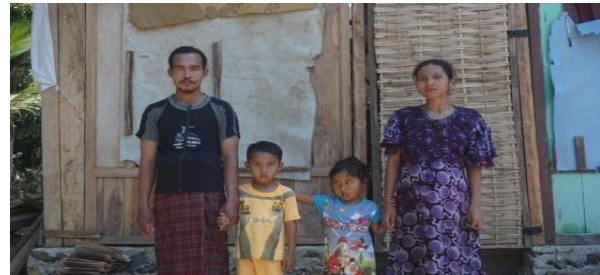
Figure 4. Family photo.