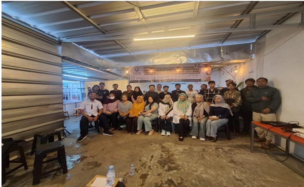
Figure 1. Counseling Activities