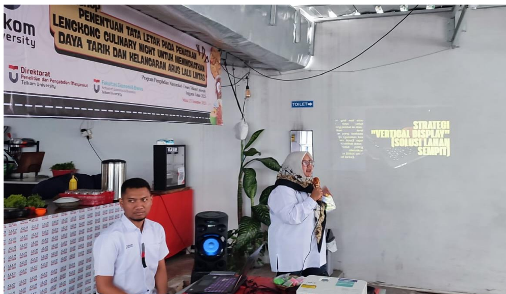
Figure 2. Counseling Delivery

The activity was carried out through several stages, namely: counseling regarding the role of MSME layout in supporting the smooth flow of area activities; participatory discussions to explore location arrangement issues based on partners' field experiences; non-technical initial assistance aimed at aligning perceptions and enhancing community readiness; and partner satisfaction evaluation through structured questionnaires (Lestari et al., 2023; Yuliana & Prasetyo, 2020). This phased approach aligns with community service practices that emphasize the importance of social and institutional readiness before technical interventions are implemented (Firmansyah & Laksana, 2022; Hendayani et al., 2024).