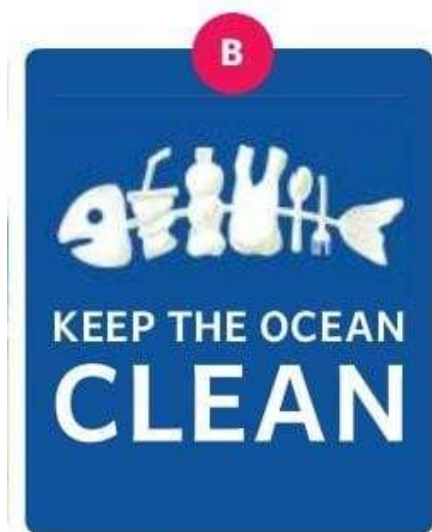
Picture 3.10 Keep the Ocean Clean