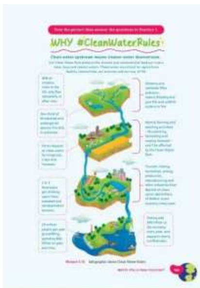
Figure 2. Infographic about clean water rules

The verbal text in the Clean Water Rules infographic demonstrates the importance of Clean Water Rules and how they affect various aspects of life. Meanwhile, the visual elements illustrate a layered graphic representation of the water flow from upstream to downstream, as well as the human and environmental activities influenced by the circumstances. These visuals not only repeat verbal information, but also clarify and enrich the text's meaning by presenting contextual and situational details such as the relationships between upstream areas, fisheries, agricultural and livestock systems, residential areas, economic systems, and coastal areas. Through these interactions, the graphics provide readers with contextual information about the setting and environmental circumstances constructing complementarily between verbal and visual modes, allowing students to better comprehend how clean water rules affects human life and nature in general.