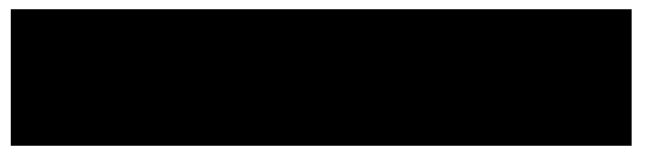
Figure 1 Simple AON 2765 DWT Tanker

Table 2 above shows the relationship between activities which are symbolized or coded using letters, the table is able to show the relationship between activities which can be known which activities were in the past and which activities will be carried out afterwards. For example the activity 'providing the necessary facilities before repairs are carried out at the shipyard' which is symbolized by the letter A can be carried out without waiting for any work and as a precursor activity, work B and C can be carried out afterwards. For more details, see the AON image in Figure 1 below. this :