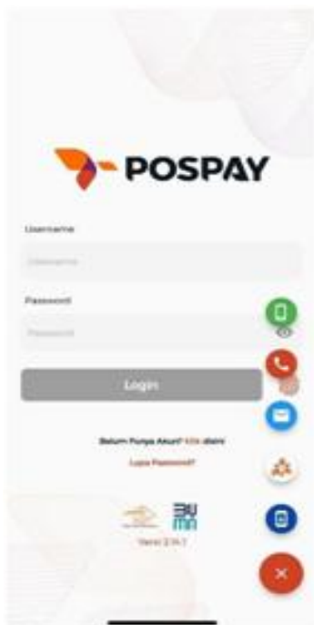
Figure 2 : Pospay Application information features