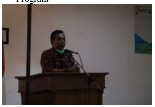
Pic 4. Welcome From The Head of The Study Program

2. Welcome From The Head of The Study Program