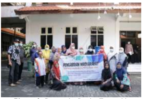
Picture 2. Community Service Team with Independent Orphans and FAMILY WELFARE DEVELOPMENT Yosowilangun

The existence of limited activities both in the Gresik area and in various parts of Indonesia due to the arrival of the covid-19 virus made this service based on the socialization of Fish farming in buckets encounter many obstacles, one of which was that only 2 invited partners could take the time to contribute to this service activity, namely Yatim Mandiri Foundation and FAMILY WELFARE DEVELOPMENT Yosowilangon.