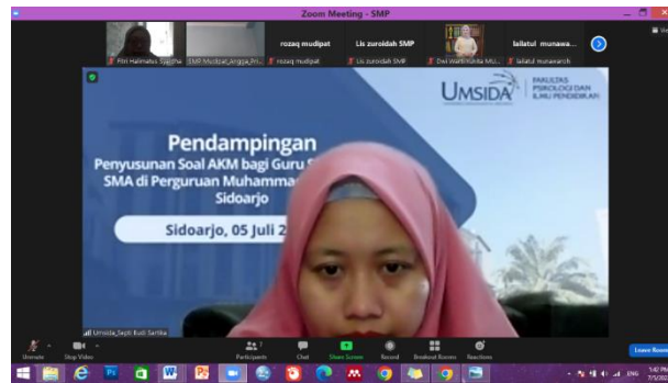
Figure 2. Assistance in Developing MCA Questions Online with Secondary School Teachers'

Based on Figure 2, meanwhile, the suggestions given by the speaker, to the participants after presenting the results of making the development of MCA questions according to the subjects they taught, were as follows: