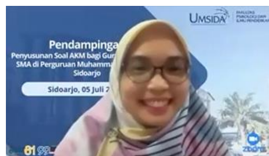
Figure 3. Assitance ini Developing MCA Questions Online with High School Teachers'

The importance of this assistance is for participants (high school teachers), because they will understand the essence of MCA, they don't just compile MCA questions for granted, but they understand what they compose MCA questions in relation to their subjects. the lessons he taught. With this assistance, there has been a good change where at first the teachers were just familiar with MCA policies, now they can develop instruments for MCA questions in various subjects.