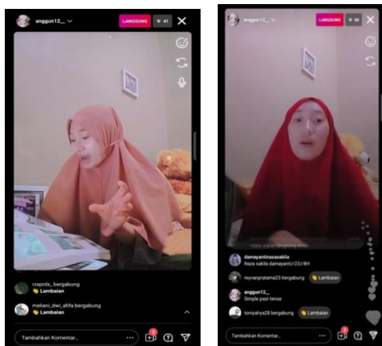
Figures 1 & 2: Online learning teaching using IG TV

These students are selected based on who actively participates in the class. 12 items of instruments for the questionnaire used were tested based on using Instagram TV as their media platform to do online learning. The questionnaire using English Language was filled in by students using Google form. And for qualitative data, interviews were used to explore student's perceptions regarding Instagram TV use for educational and language learning purposes, student achievement scores in the experimental study. The Interviews were conducted one by one to students while doing extra classes at school directly.