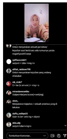
Figures 3 & 4: Students actively responding to the teacher's explanations during the online learning via IG TV