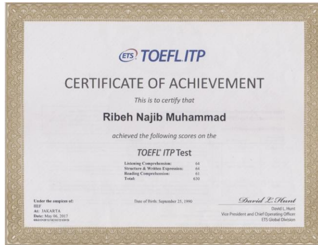
Figure 1. TOEFL ITP Score Record (Authorized TOEFL)