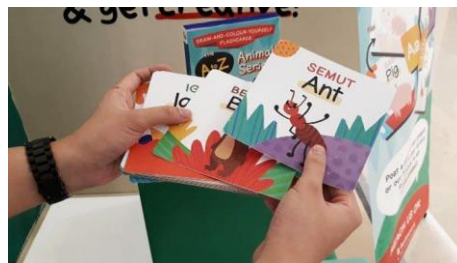
Figure 3. Flashcards for learning media

3. The application of learning media uses flashcard. The material used by authors aims to increase speaking skill and quality of learning that is more interesting and fun. Therefore, learning process with use game more innovative to increase knowledge and motivations students. The application of this media can make students and teachers interact ell so that students do not just sit down and also record English in the classroom, but also have media that can refresh the learning topic but not far from the topic of learning.