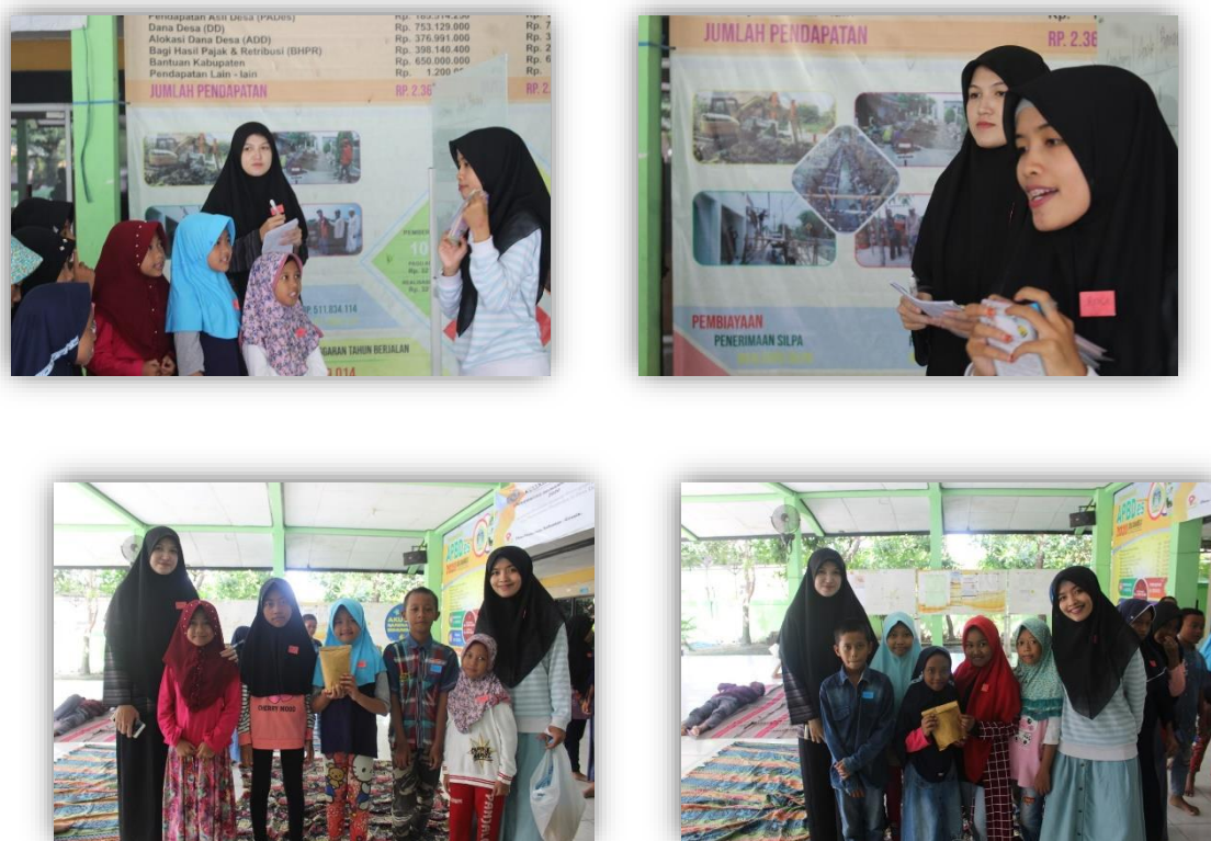
Figure 2. Learning and teaching activity in Dahanrejo village.

In this action research, there are standard to step the cycle. The cycle is stopped when of the of the students are able to carry out the accuracy criteria such as, correct in structural usage, correct in vocabulary usage and sign of fluency include a reasonably fast speed of speaking and only a small number of pauses and “ums” and “ers”.