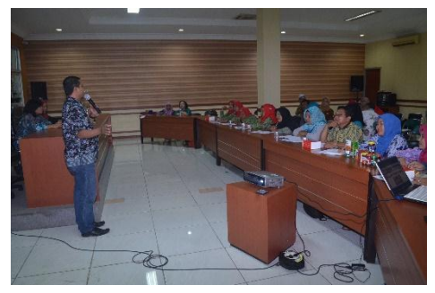
Figure 2. Implementation of Training

Most of the SME otak-otak of milkfish in Gresik Regency have obstacles in making correct financial statements, it is due to educational background and never participates in financial reporting training. So far, owners of SME cannot distinguish between business activities and personal activities, so the finances are mixed. Therefore, the Society Partnership Program Team helps SME owners in providing financial balance sheet training in collaboration with the Department of Cooperatives, SME, Industry and Trade of Gresik Regency. Implementation of the financial balance sheet training can be seen in Figure 2 below.