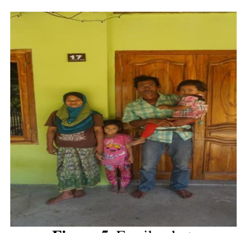
Figure 5. Family photo.