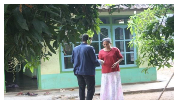
Figure 3. Submission of family photos.