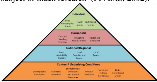
Figure 2. Different levels of food security. Based on ideas from the Committee on the FIVIMS initiative (FIVIMS, 2002) and Food Security (FAO, IFAD, UNICEF, WFP and WHO, 2019).

These can be seen in Figure 2 and range from the individual to the household to the national; in turn, these concepts are further underpinned by several contextual factors whose understanding and interplay are the subject of much research (FIVIMS, 2002).